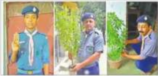
ऑनलाइन कार्यक्रम में भाग लेते स्काउट-गाइड.

हरद्वार, विद्युत स्काउट स्काफ्ट दिवस के अवसर पर शनिवार को जिले के सभी स्काउट्स और गाइड्स ने अपनी प्रतिज्ञाओं को खद किया. इस अवसर पर फौररोगण और चित्रकला कार्यक्रम के जरिदे पर्यवेक्षण संरक्षण के प्रति लोगों को जागरुक किया गया. भारत स्काउट एवं गाइड, वैशाली के तत्वावधान में आयोजित ऑनलाइन कार्यक्रम में जिले के स्काउट शिक्षक, गाइड कैप्टन, सेवर्स, रैजर्स, काब-चुलचुल के अलावा प्रखंड प्रभारियों और सभी पर्यवेक्षकों ने अपनी प्रतिज्ञा को दुहराते हुए देश सेवा का संकल्प लिया.