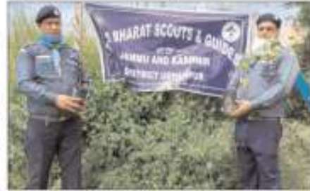
schools including ornamental plants. He expressed his gratitude towards District Administration Udhampur and chief education officer